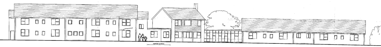
WEST ELEVATION SCALE 1:50