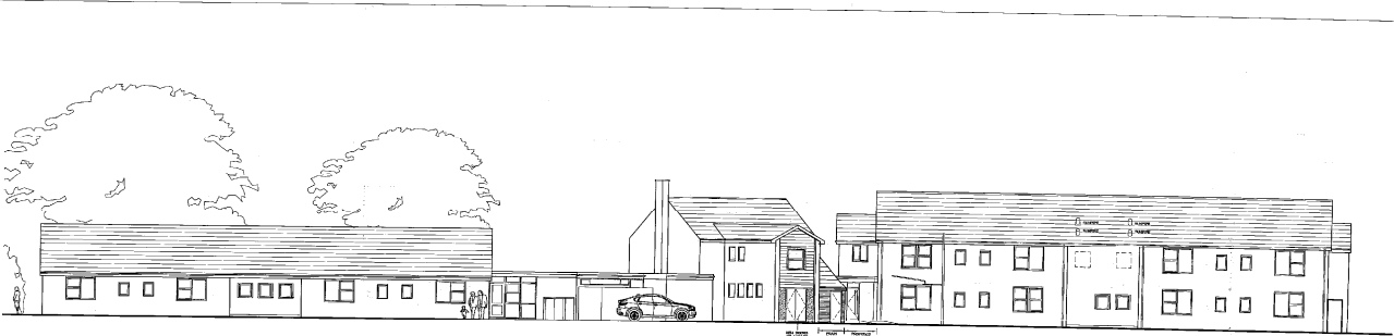
EAST ELEVATION SCALE 1:50

Scale: 1:125 & 1:50 @ A1 Drawn By Checked By Date SW 22.05.12 Drawing Number: A12-10 / 04 C